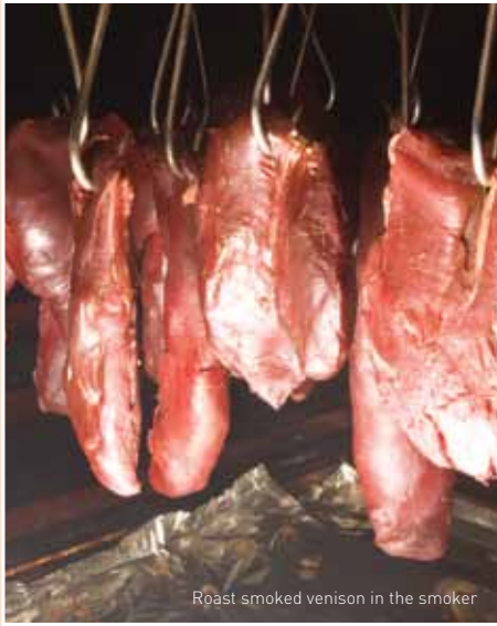
Roast smoked venison in the smoker

A surfeit of pheasant led Serena to establish her business